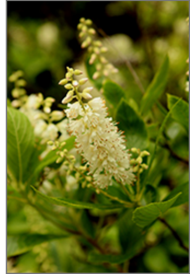
Summersweet flowers