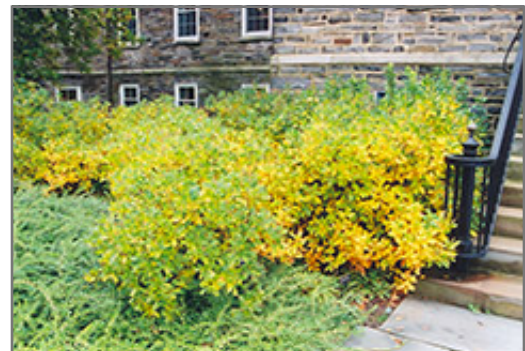
Summersweet in fall