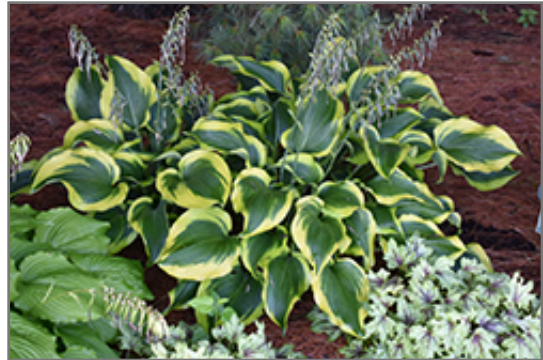
Atlantis Hosta