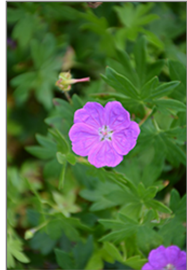
New Hampshire Purple Cranesbill flowers

New Hampshire Purple Cranesbill is a fine choice for the garden, but it is also a good selection for planting in outdoor pots and containers. It is often used as a 'filler' in the 'spiller-thriller-filler' container combination, providing a mass of flowers against which the thriller plants stand out. Note that when growing plants in outdoor containers and baskets, they may require more frequent waterings than they would in the yard or garden. Be aware that in our climate, most plants cannot be expected to survive the winter if left in containers outdoors, and this plant is no exception. Contact our experts for more information on how to protect it over the winter months.