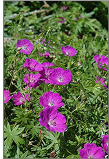
New Hampshire Purple Cranesbill flowers

New Hampshire Purple Cranesbill is a dense herbaceous perennial with a mounded form. It brings an extremely fine and delicate texture to the garden composition and should be used to full effect.