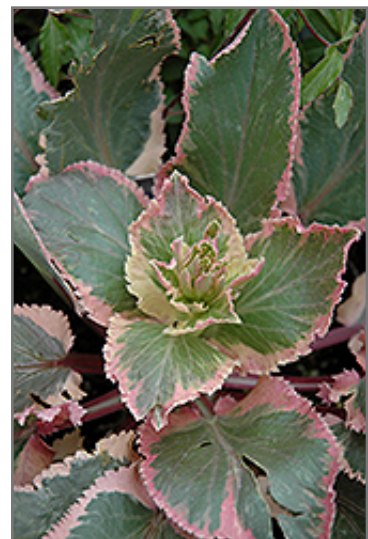
Jade Frost Variegated Sea Holly foliage