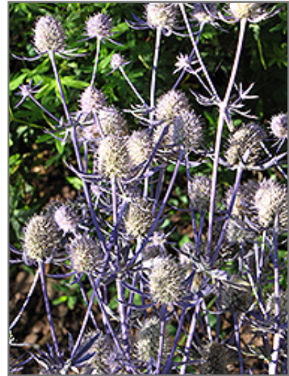
Jade Frost Variegated Sea Holly flowers

Jade Frost Variegated Sea Holly is a fine choice for the garden, but it is also a good selection for planting in outdoor pots and containers. It can be used either as 'filler' or as a 'thriller' in the 'spiller-thriller-filler' container combination, depending on the height and form of the other plants used in the container planting. Note that when growing plants in outdoor containers and baskets, they may require more frequent waterings than they would in the yard or garden. Be aware that in our climate, most plants