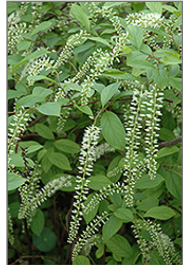
Henry's Garnet Virginia Sweetspire flowers