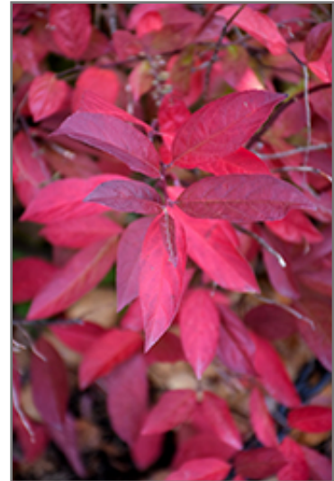
Henry's Garnet Virginia Sweetspire in fall

This shrub performs well in both full sun and full shade. It is an amazingly adaptable plant, tolerating both dry conditions and even some standing water. It is not particular as to soil type or pH. It is somewhat tolerant of urban pollution. This is a selection of a native North American species.