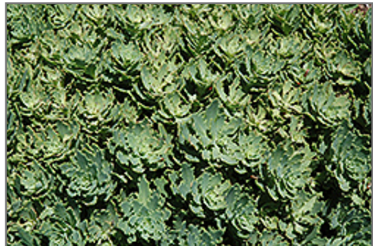
Thundercloud Stonecrop