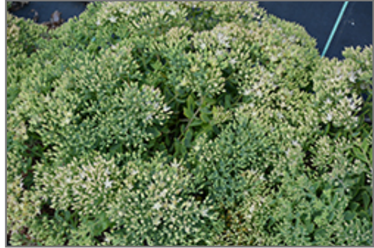
Thundercloud Stonecrop flower buds