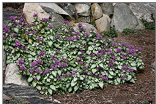
Purple Dragon Spotted Dead Nettle in bloom