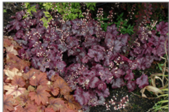
Plum Royale Coral Bells in bloom