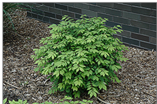
Little Moses Burning Bush