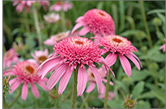
Cone-fections Pink Double Delight Coneflower flowers

Cone-fections Pink Double Delight Coneflower is an herbaceous perennial with an upright spreading habit of growth. Its medium texture blends into the garden, but can always be balanced by a couple of finer or coarser plants for an effective composition.