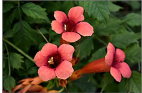
Flamenco Trumpetvine flowers

Flamenco Trumpetvine is a dense multi-stemmed deciduous woody vine with a twining and trailing habit of growth. Its average texture blends into the landscape, but can be balanced by one or two finer or coarser trees or shrubs for an effective composition.