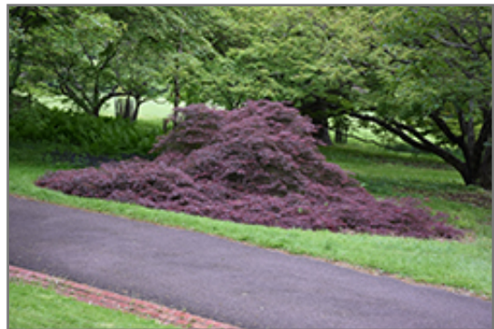
Garnet Cutleaf Japanese Maple