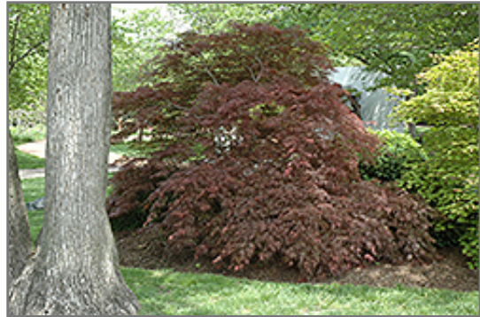
Garnet Cutleaf Japanese Maple

Garnet Cutleaf Japanese Maple will grow to be about 10 feet tall at maturity, with a spread of 8 feet. It has a low canopy with a typical clearance of 1 foot from the ground, and is suitable for planting under power lines. It grows at a fast rate, and under ideal conditions can be expected to live for 60 years or more.