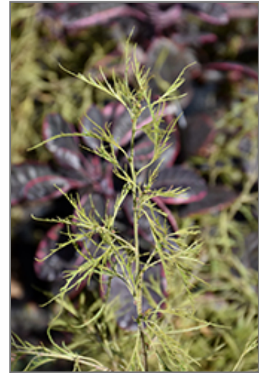
Trost's Dwarf European Birch foliage

This shrub will require occasional maintenance and upkeep, and should only be pruned in summer after the leaves have fully developed, as it may 'bleed' sap if pruned in late winter or early spring. Gardeners should be aware of the following characteristic(s) that may warrant special consideration;