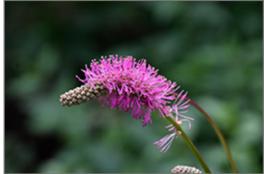
Japanese Bottlebrush flowers

This plant will require occasional maintenance and upkeep, and is best cleaned up in early spring before it resumes active growth for the season. It has no significant negative characteristics.