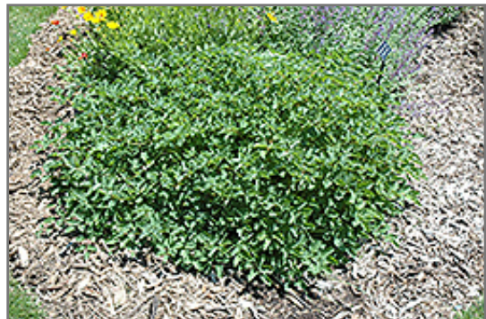
Japanese Bottlebrush