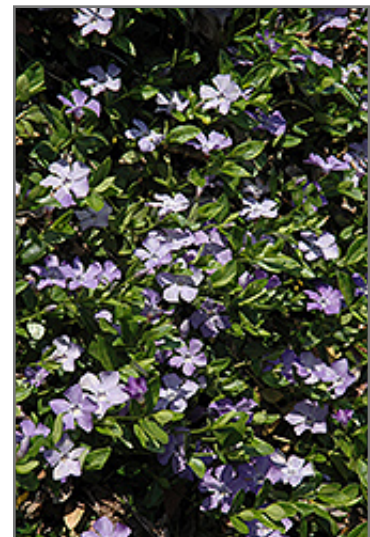
Common Periwinkle in bloom