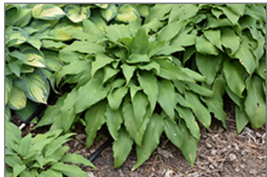
Red October Hosta