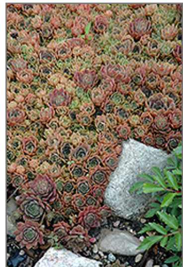
Silverine Hens And Chicks