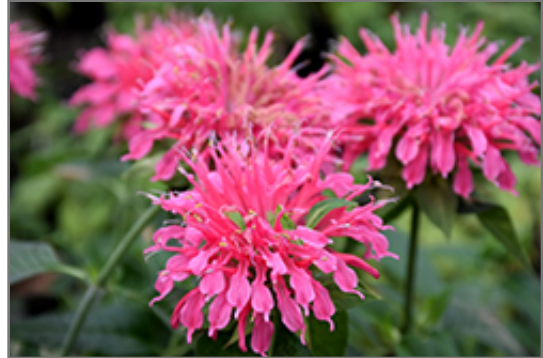
Coral Reef Beebalm flowers