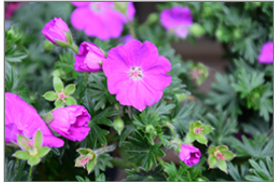
Max Frei Cranesbill flowers