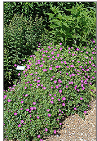
Max Frei Cranesbill in bloom