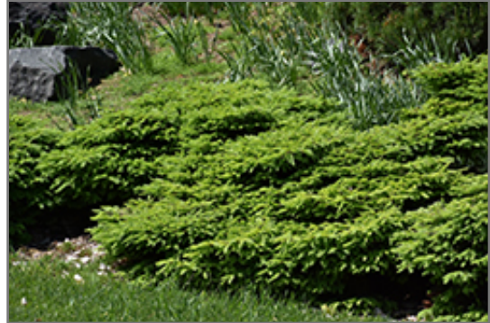
Little Gem Spruce

This shrub does best in full sun to partial shade. It does best in average to evenly moist conditions, but will not tolerate standing water. It is not particular as to soil type or pH, and is able to handle environmental salt. It is highly tolerant of urban pollution and will even thrive in inner city environments. This is a selected variety of a species not originally from North America.