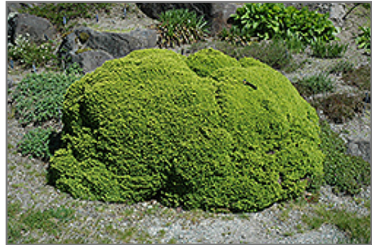
Little Gem Spruce

This is a relatively low maintenance shrub. When pruning is necessary, it is recommended to only trim back the new growth of the current season, other than to remove any dieback. Deer don't particularly care for this plant and will usually leave it alone in favor of tastier treats. It has no significant negative characteristics.