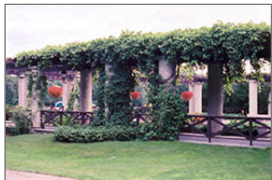
Virginia Creeper