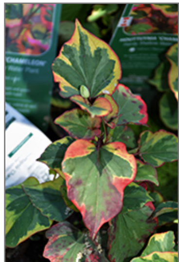
Variegated Chameleon Plant foliage