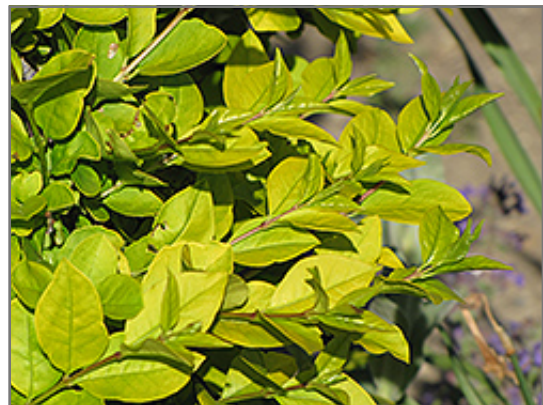
Golden Privet foliage