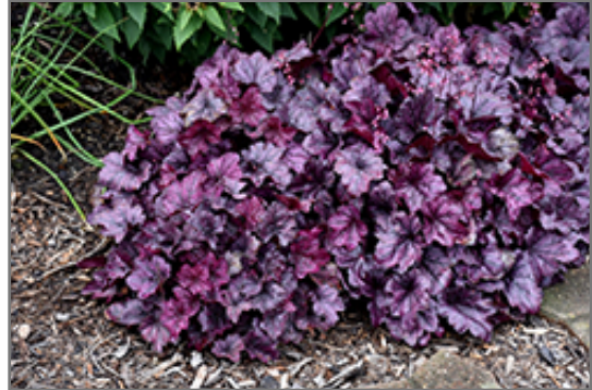
Wild Rose Coral Bells

Wild Rose Coral Bells is a dense herbaceous evergreen perennial with tall flower stalks held atop a low mound of foliage. Its relatively coarse texture can be used to stand it apart from other garden plants with finer foliage.