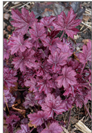
Wild Rose Coral Bells foliage