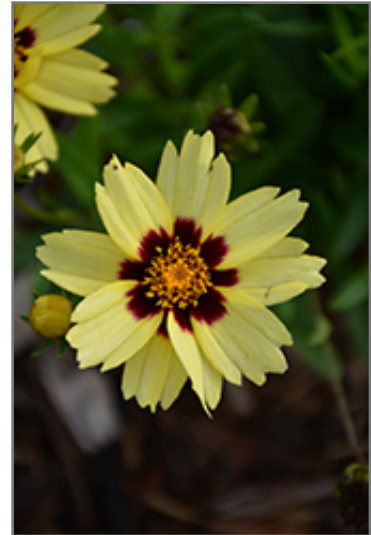
UpTick Cream and Red Tickseed flowers

UpTick Cream and Red Tickseed is an open herbaceous perennial with a mounded form. It brings an extremely fine and delicate texture to the garden composition and should be used to full effect.