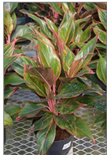
Siam Aurora Chinese Evergreen in full

Ottawa West 2079 Carp Road Ottawa, Ontario, Canada K2S 1B9 Telephone: +1 613 836 6880