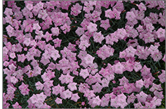
Bath's Pink Pinks in bloom

Bath's Pink Pinks is recommended for the following landscape applications;