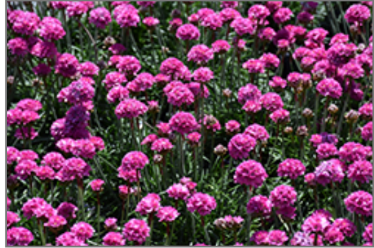
Dusseldorf Pride Sea Thrift flowers

Dusseldorf Pride Sea Thrift is a fine choice for the garden, but it is also a good selection for planting in outdoor pots and containers. It is often used as a 'filler' in the 'spiller-thriller-filler' container combination, providing a mass of flowers against which the thriller plants stand out. Note that when growing plants in outdoor containers and baskets, they may require more frequent waterings than they would in the yard or garden. Be aware that in our climate, most plants cannot be expected to survive the winter if left in containers outdoors, and this plant is no exception. Contact our experts for more information on how to protect it over the winter months.