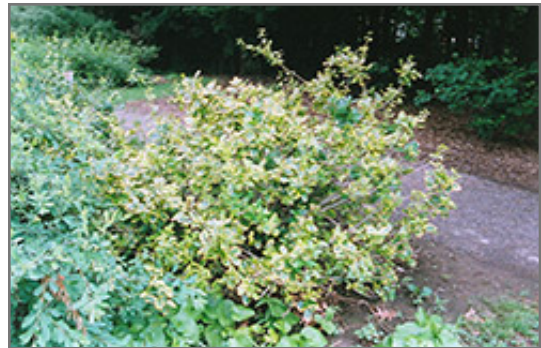
E.T. Gold Wintercreeper