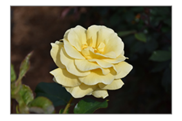
Sunshine Daydream Rose flowers

Brockville 3043 County Rd. 29 Brockville, Ontario, Canada K6V 5T4 Telephone: +1 613 341 9343