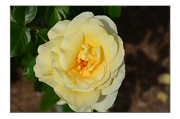
Sunshine Daydream Rose flowers