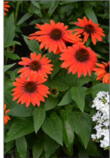
Sombrero Flamenco Orange Coneflower in bloom

This is a relatively low maintenance plant, and is best cleaned up in early spring before it resumes active growth for the season. It is a good choice for attracting butterflies to your yard, but is not particularly attractive to deer who tend to leave it alone in favor of tastier treats. It has no significant negative characteristics.