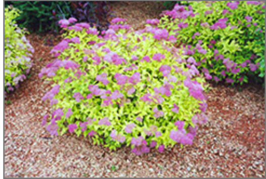
Goldmound Spirea in bloom

This shrub should only be grown in full sunlight. It prefers to grow in average to moist conditions, and shouldn't be allowed to dry out. It is not particular as to soil type or pH. It is highly tolerant of urban pollution and will even thrive in inner city environments. This is a selected variety of a species not originally from North America.