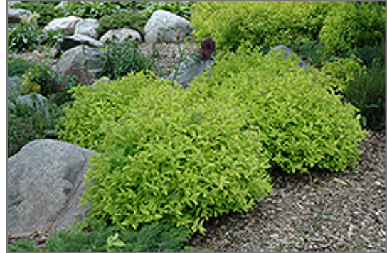
Goldmound Spirea

This shrub will require occasional maintenance and upkeep, and is best pruned in late winter once the threat of extreme cold has passed. It is a good choice for attracting butterflies to your yard, but is not particularly attractive to deer who tend to leave it alone in favor of tastier treats. It has no significant negative characteristics.