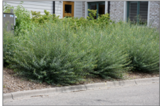
Dwarf Arctic Willow