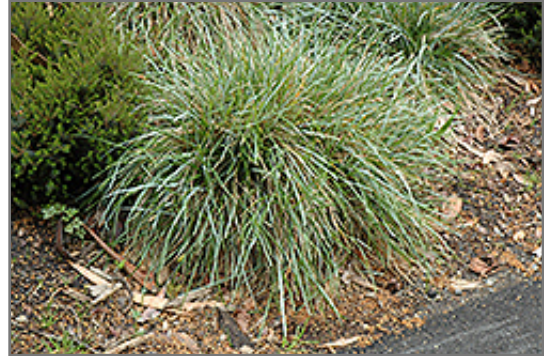
Blue Moor Grass

Blue Moor Grass is recommended for the following landscape applications;