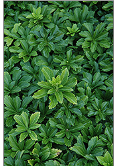
Green Sheen Japanese Spurge foliage