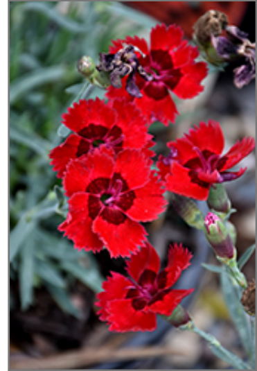
Fire Star Pinks flowers

This is a relatively low maintenance plant, and is best cleaned up in early spring before it resumes active growth for the season. It is a good choice for attracting bees and butterflies to your yard, but is not particularly attractive to deer who tend to leave it alone in favor of tastier treats. It has no significant negative characteristics.