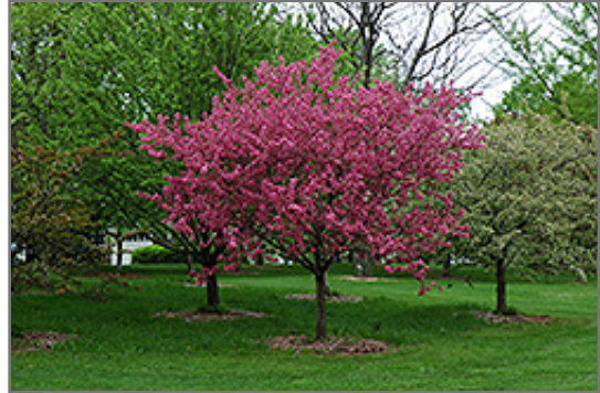
Prairifire Flowering Crab in bloom

Prairifire Flowering Crab is a deciduous tree with an upright spreading habit of growth. Its average texture blends into the landscape, but can be balanced by one or two finer or coarser trees or shrubs for an effective composition.