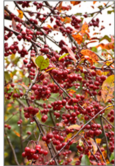
Prairifire Flowering Crab fruit

This tree should only be grown in full sunlight. It prefers to grow in average to moist conditions, and shouldn't be allowed to dry out. It is not particular as to soil type or pH. It is highly tolerant of urban pollution and will even thrive in inner city environments. This particular variety is an interspecific hybrid.