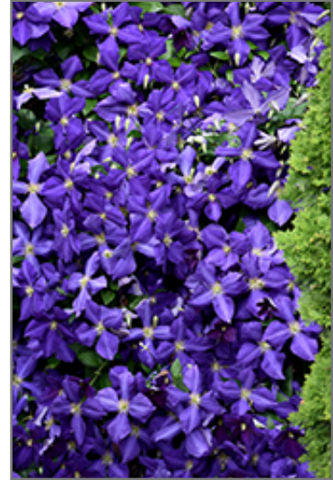
Jackmanii Clematis in bloom

Jackmanii Clematis is recommended for the following landscape applications;