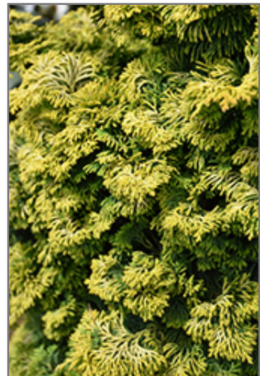
Dwarf Golden Hinoki Falsecypress foliage

Ottawa West 2079 Carp Road Ottawa, Ontario, Canada K2S 1B9 Telephone: +1 613 836 6880