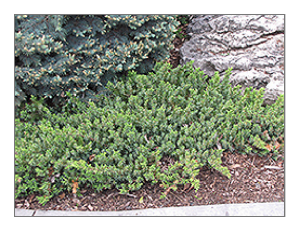
Dwarf Japanese Garden Juniper

This is a relatively low maintenance shrub, and is best pruned in late winter once the threat of extreme cold has passed. Deer don't particularly care for this plant and will usually leave it alone in favor of tastier treats. It has no significant negative characteristics.