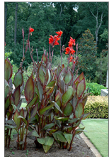
Australia Canna in bloom