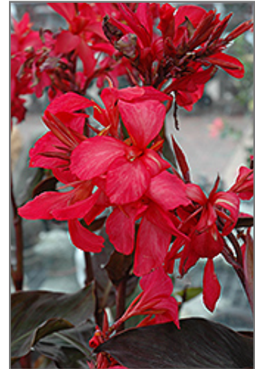
Australia Canna flowers

This plant is native to the tropics and prefers growing in moist environments with evenly warm conditions all year round. In our climate, it is usually grown as an outdoor annual in the garden or in a container. If you want it to survive the winter, it can be brought in to the house and provided with special care, and then returned to the garden the following season. In its preferred tropical habitat, it can grow to be around 8 feet tall at maturity, with a spread of 4 feet. However, when grown as an annual or when overwintered indoors, it can be expected to perform differently, and its exact height and spread will depend on many factors; you may wish to consult with our experts as to how it might perform in your specific application and growing conditions.