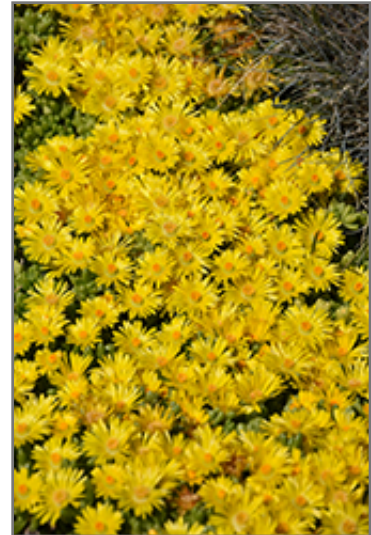
Yellow Ice Plant flowers

Yellow Ice Plant is recommended for the following landscape applications;