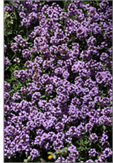
Pink Chintz Creeping Thyme flowers

This plant will require occasional maintenance and upkeep, and is best cleaned up in early spring before it resumes active growth for the season. Deer don't particularly care for this plant and will usually leave it alone in favor of tastier treats. Gardeners should be aware of the following characteristic(s) that may warrant special consideration;