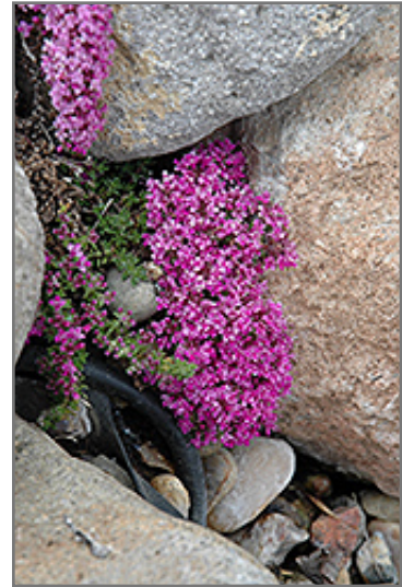
Pink Chintz Creeping Thyme in bloom

This plant should only be grown in full sunlight. It prefers to grow in average to dry locations, and dislikes excessive moisture. It is considered to be drought-tolerant, and thus makes an ideal choice for a low-water garden or xeriscape application. It is not particular as to soil type or pH. It is highly tolerant of urban pollution and will even thrive in inner city environments. Consider covering it with a thick layer of mulch in winter to protect it in exposed locations or colder microclimates. This is a selected variety of a species not originally from North America. It can be propagated by division; however, as a cultivated variety, be aware that it may be subject to certain restrictions or prohibitions on propagation.