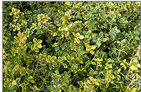
Doone Valley Thyme