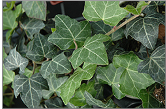
Baltic Ivy foliage

Baltic Ivy is recommended for the following landscape applications;