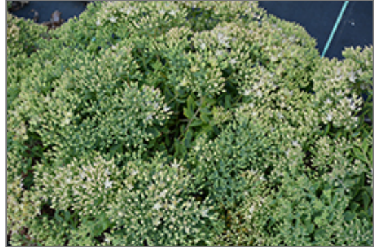
Thundercloud Stonecrop flower buds