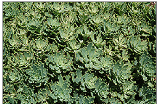
Thundercloud Stonecrop