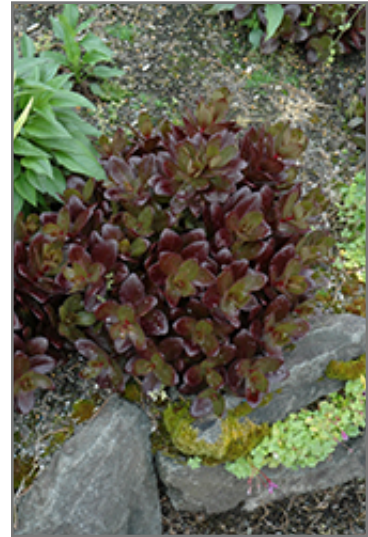
Chocolate Drop Stonecrop

Chocolate Drop Stonecrop is a dense herbaceous perennial with an upright spreading habit of growth. Its relatively coarse texture can be used to stand it apart from other garden plants with finer foliage.