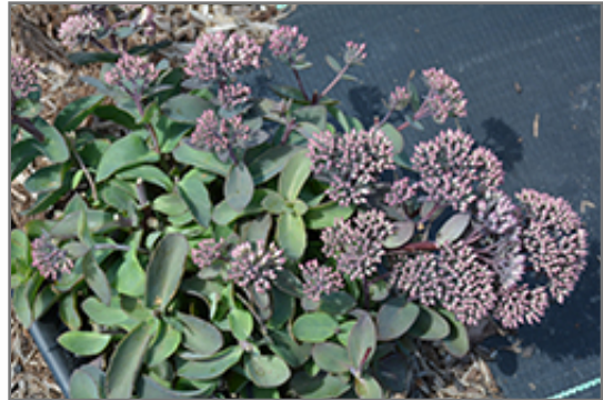
Chocolate Drop Stonecrop flower buds