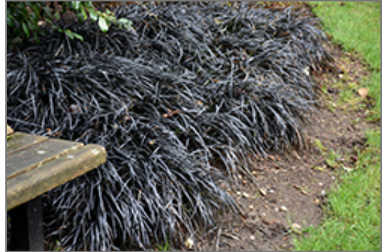
Black Mondo Grass

Black Mondo Grass is recommended for the following landscape applications;