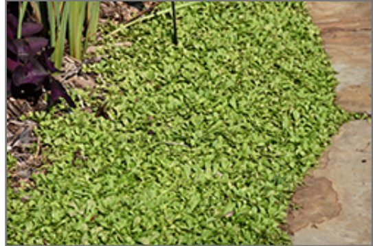
Creeping Mazus

Creeping Mazus is a fine choice for the garden, but it is also a good selection for planting in outdoor pots and containers. Because of its spreading habit of growth, it is ideally suited for use as a 'spiller' in the 'spiller-thriller-filler' container combination; plant it near the edges where it can spill gracefully over the pot. Note that when growing plants in outdoor containers and baskets, they may require more frequent waterings than they would in the yard or garden. Be aware that in our climate, most plants cannot be expected to survive the winter if left in containers outdoors, and this plant is no exception. Contact our experts for more information on how to protect it over the winter months.