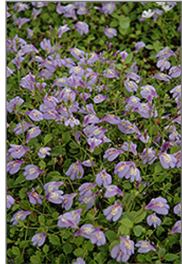
Creeping Mazus flowers

This plant will require occasional maintenance and upkeep, and is best cleaned up in early spring before it resumes active growth for the season. It is a good choice for attracting butterflies to your yard. Gardeners should be aware of the following characteristic(s) that may warrant special consideration;