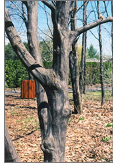
American Hornbeam bark

This tree performs well in both full sun and full shade. It is an amazingly adaptable plant, tolerating both dry conditions and even some standing water. It is not particular as to soil type or pH. It is somewhat tolerant of urban pollution. This species is native to parts of North America.