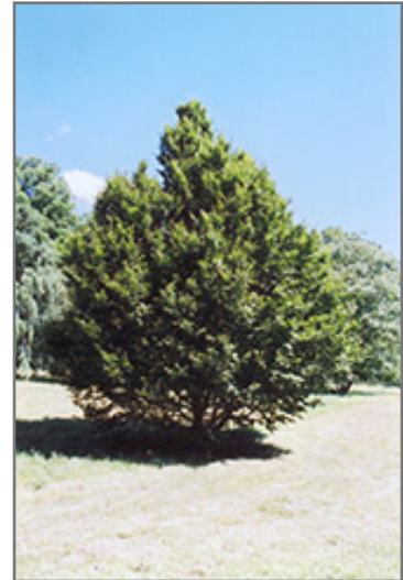
American Hornbeam

This is a relatively low maintenance tree, and is best pruned in late winter once the threat of extreme cold has passed. It has no significant negative characteristics.